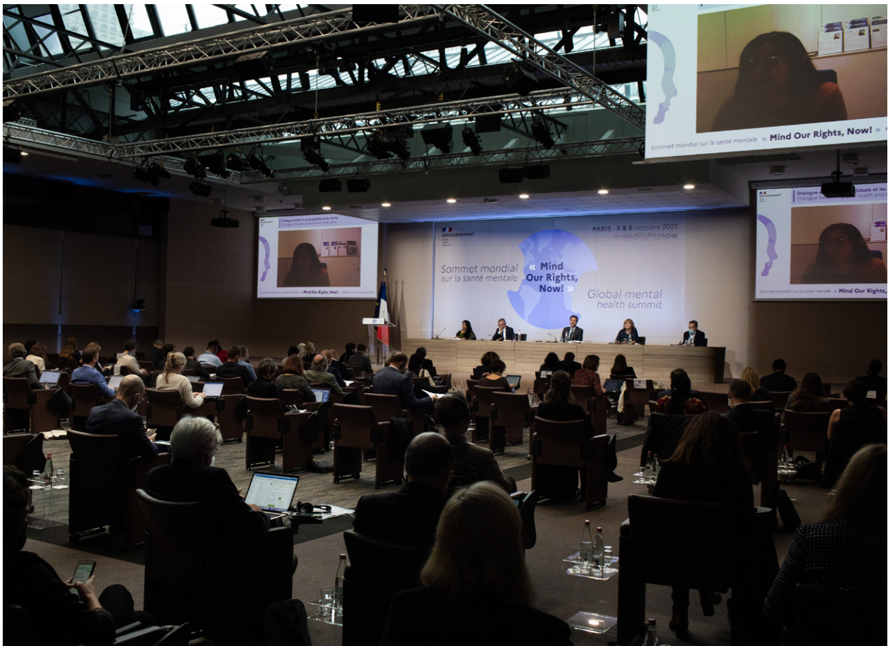
Plenary session in Paris on “Dialogue between global health and rights”

The Paris summit “Mind Our Rights, Now!” was co-organized by the Ministry of Health and the Ministry for Europe and Foreign affairs and was held on October 5 and 6, 2021 at the Convention Center of the Ministry Foreign Affairs in Paris.