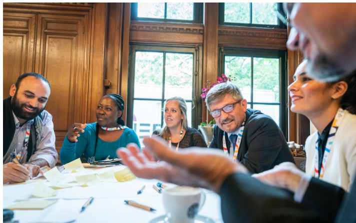
In-depth sessions served to prepare universal, practicable recommendations

The level to which MHPSS has become a subject which gets attention from national and local authorities as well as from both funding and implementing organizations, can be seen for example when looking at this mapping of MHPSS-initiatives in Ukraine. The quantity of activities in this field is encouraging; it also underlines the need for coordination and quality support.