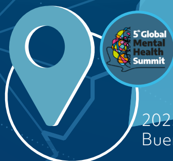
2023 Buenos Aires