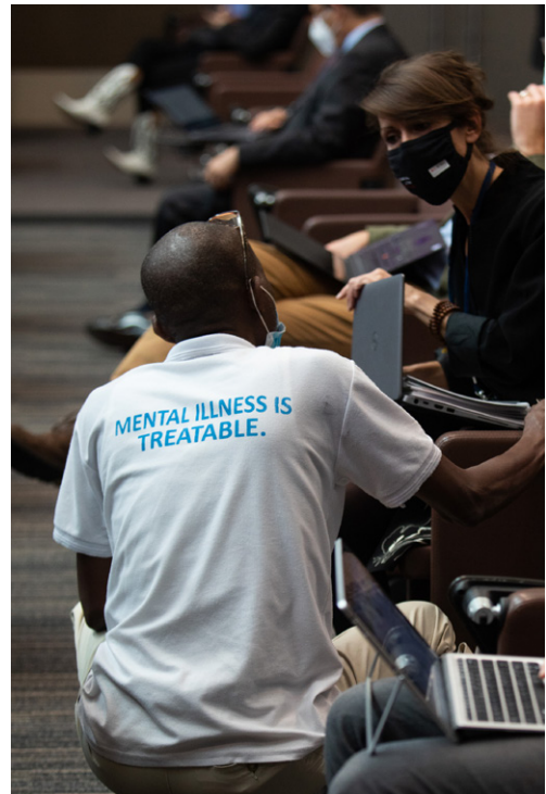
NGOs (here Unicef) contributed to the debates in Paris

https://sante.gouv.fr/IMG/pdf/sommet_mondial_sante_summary_document_en.pdf