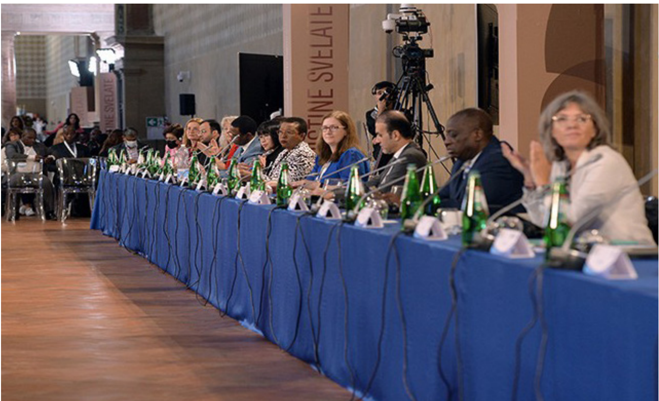
Snapshot of the Interventions by Heads of Delegations during GMHS 2022