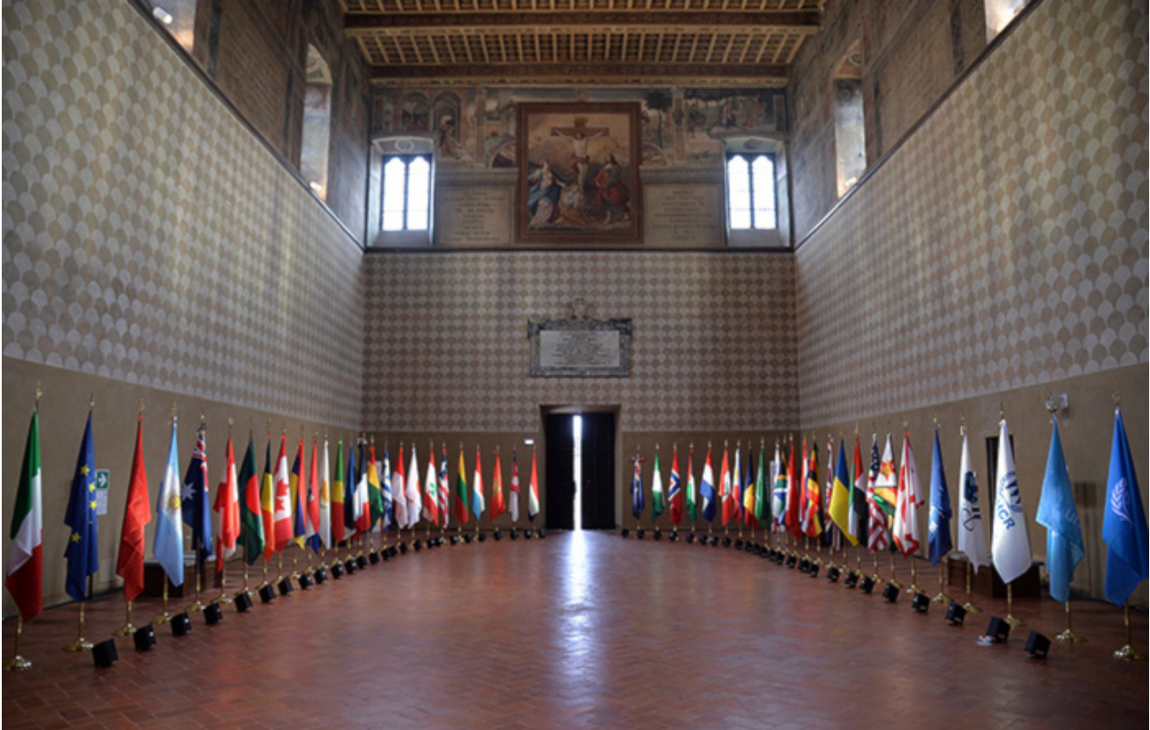
Flags of delegations represented at the GMHS 2022

The Summit proceeded along the roadmap launched in London in 2018 by further increasing mental health awareness and commitment, among policymakers and the civil society.